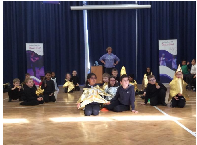
Y2 and Y1 went to dance fest on Thursday at St Bernadette where they performed their amazing dances. Y1 had the theme of rainbows and Y2 performed a stary sequence. The staff at the school were very impressed with their performances and behaviour throughout the festival.